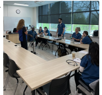
Health Care Team Based Challenge Event

May has been a whirlwind of activity as we wrap up my first semester at Waubonsee. I have enjoyed interacting with students at our Skyway Art Selections Reception and serving as the keynote speaker for the National Society of Leadership and Success Induction Ceremony as well as at various concerts and a Cheer competition. I also had the opportunity to see our Medical Assistant, EMT, and Nursing students collaborate in our Health Care Team Based Challenge Event at the Fox Valley Campus. In addition to my Tour de Waubonsee listening tour sessions, I have been out and about the college at employee events such as the Retirement and Service Awards Banquet, our Arbor Day Tree Planting Ceremony, and the Association of College and University Educators (ACUE) Class of 2023 Pinning Ceremony. In addition, I learned more about the great work of our faculty by experiencing a wood firing at our Wood Kiln and an Anatomy and Physiology cadaver demonstration. And I shared information on stakeholders with our New Faculty Learning Academy. Of course, the recognition of our students at the end of the academic year is always the highlight of every year. Our Adult and Workforce Education Recognition Ceremony was truly inspirational and I enjoyed being part of my first Waubonsee commencement, and gauntlet!