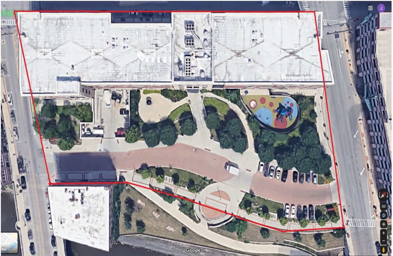
AURORA FOX VALLEY CAMPUS Area within red boundary is to be maintained