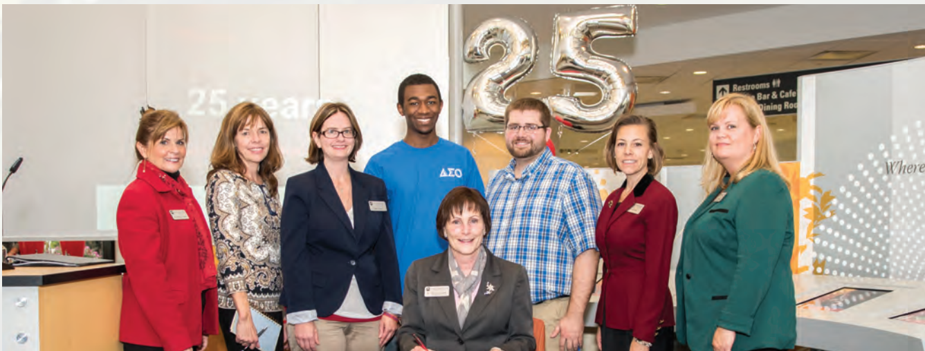
ADA signing, October 28, 2015

Waubonsee partnered with the higher education technology company Civitas, which specializes in predictive analytics modeling. That partnership will allow Waubonsee to use data to better identify trends, themes and patterns in order to mitigate student attrition. The grant will also support the college's plans to hire four Student Success Coaches who will handle students' academic, financial and social needs in order to help them persist toward graduation.