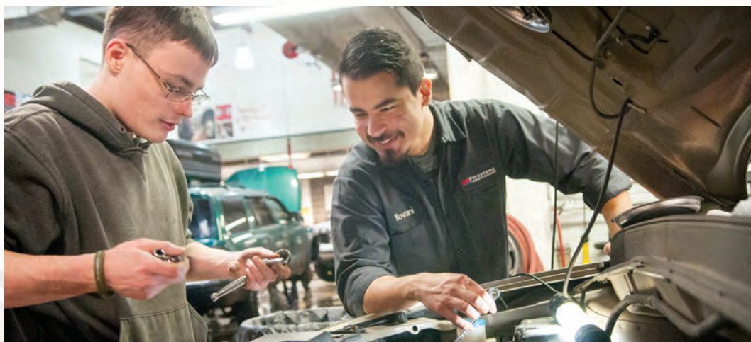
Automotive technology students repair a car.